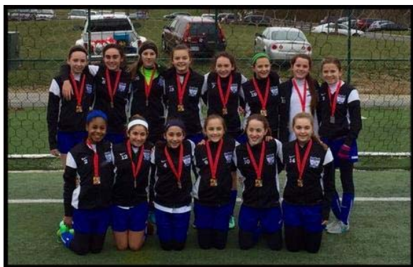
U13 Montco Alliance Finalist at Baltimore Mania