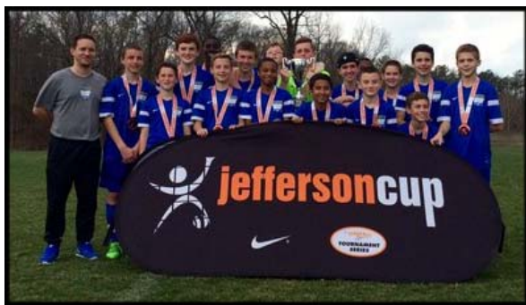
Montco Alliance 02/03 - Jefferson Cup Champions