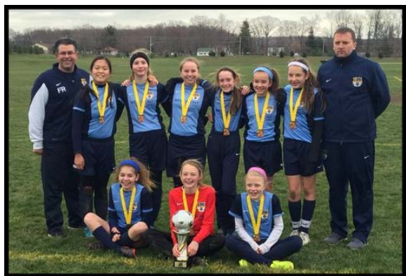
U12 Girls United Champions of Baltimore Mania